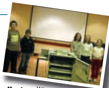
Whiston Cinema Club October 2007